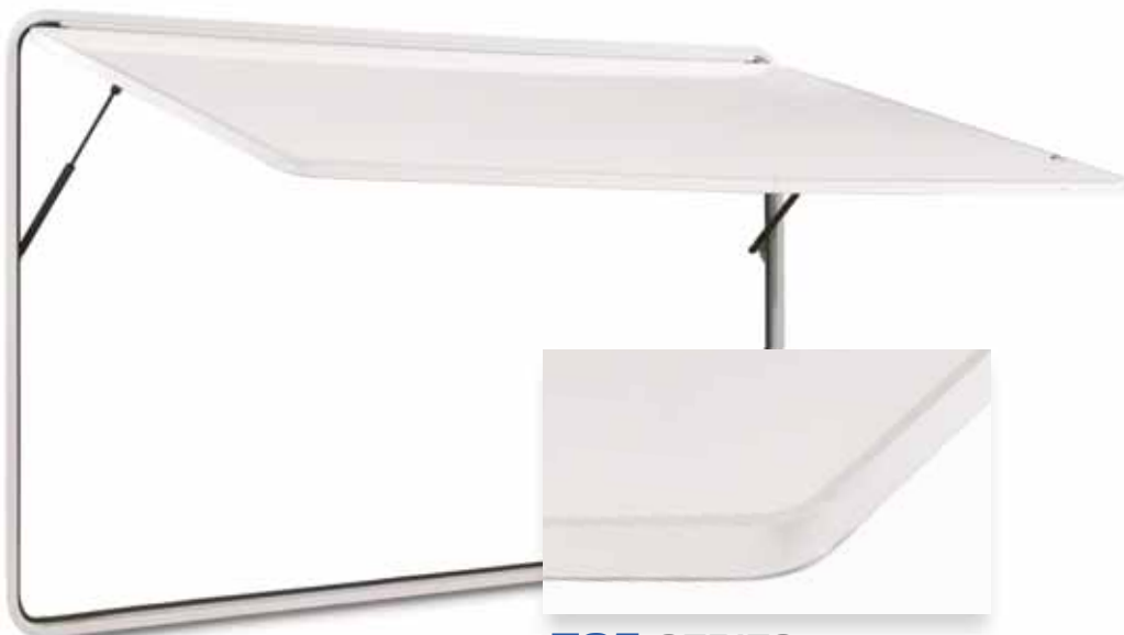
600 SERIES (open)

Our extrusion is 1.5" thick to assist with trimming the interior or the rough opening of 1" thick sidewalls.