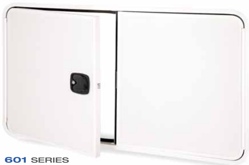
601 SERIES DOUBLE DOORS

Our extrusion is 1.5" thick to assist with trimming the interior or the rough opening of 1" thick sidewalls.