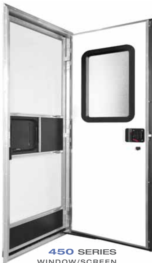
450 SERIES WINDOW/SCREEN Frame Thickness of 2.125" (open)