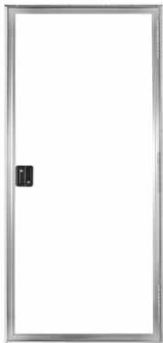
400 SERIES Frame Thickness of 1.375"