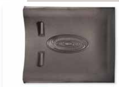
BLACK BUBBLE SLIDER PROTECTION