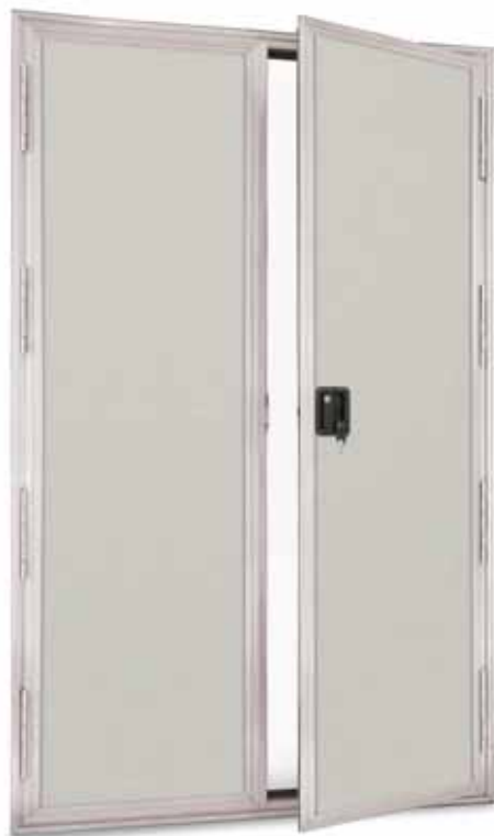
400 SERIES ENTRANCE DOUBLE DOORS Frame Thickness of 1.375" (open)