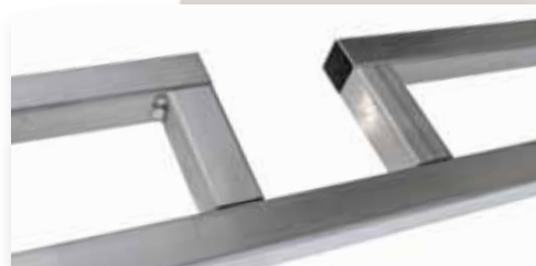
TUBE FRAME CONSTRUCTION (OPTIONAL)